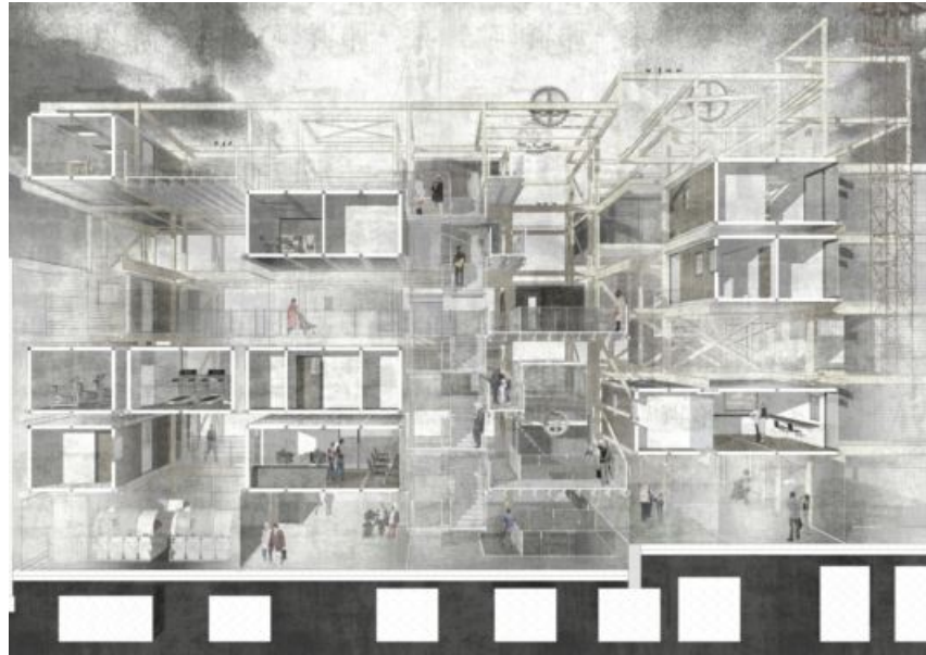
New City Industries , at 178-185 High Street West, Sunderland, England, by John Robinson Beattie.

Out of 39 entries, 21 were selected for the shortlist. Projects include small urban designs, such as Angular Flight , Behind the Side , Forgotten River , and Pink Plaza -- intended to heal and reconnect historically fractured urban fabric. The City Wall Circuit is a walking tour that traces the former town walls of Newcastle-upon-Tyne. And a number of project for the adaptation of various existing structures were proposed, including: Forgotten Relics , conversion of a ruined stone building into a reliquary; Home Surveillance , a proposal to adapt a disused theater for use as a homeless community; and New City Industries , which plans to fill a disused steel frame structure with an adaptable architecture system.