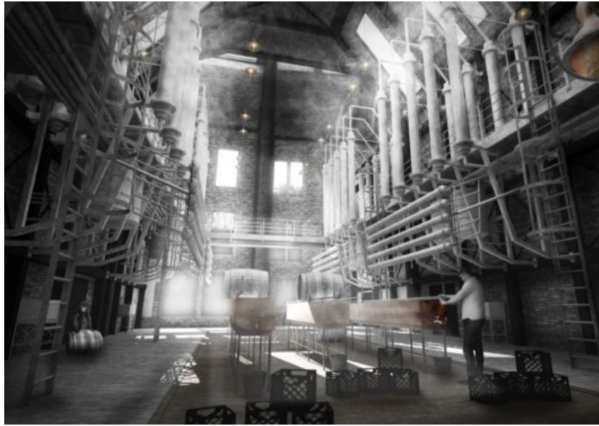
Augmented Distillery , at 4-10 St. John's Street, Newcastle upon Tyne, England, by Matt Drury.